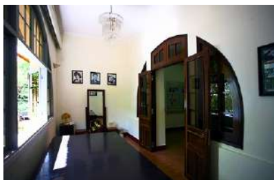
Bao Dai Villa