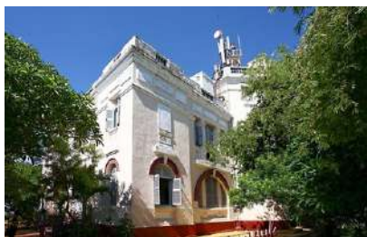
Bao Dai Villa